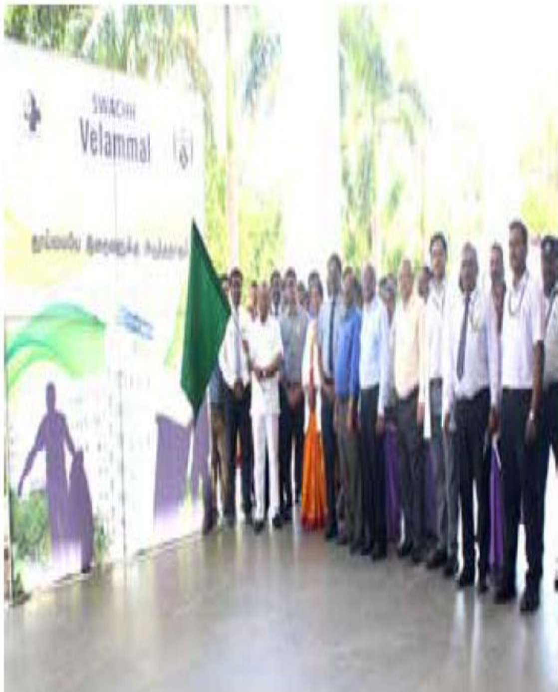
SWACHH VELAMMAL ABHIYAAN