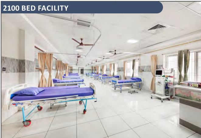
2100 BED FACILITY