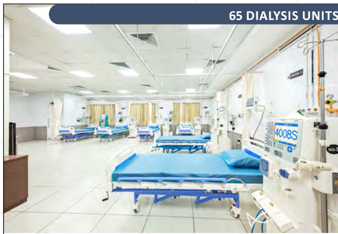
65 DIALYSIS UNITS