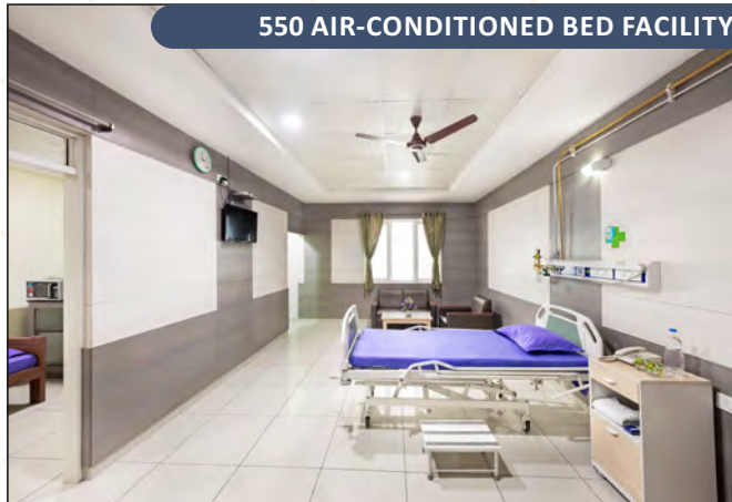
550 AIR-CONDITIONED BED FACILITY