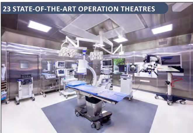
23 STATE-OF-THE-ART OPERATION THEATRES