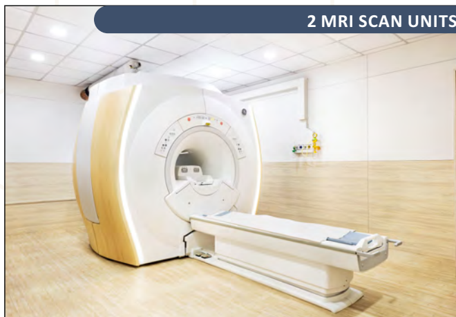
2 MRI SCAN UNITS