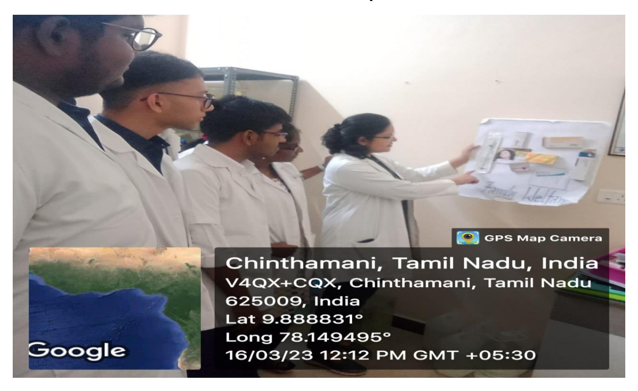
Demonstration of Gross Specimens