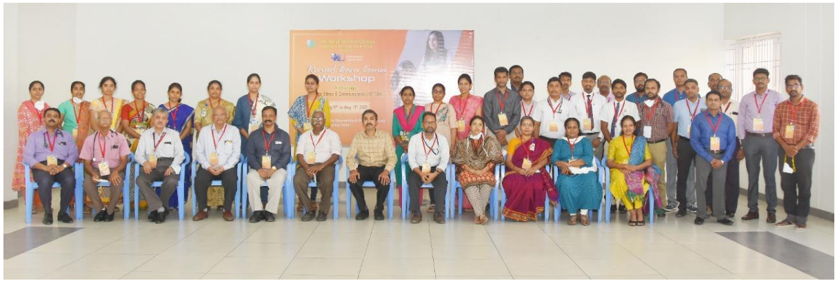
Group Photo rBCW. AET-COM Velammal Medical College Aug 9 to 11 th 2021