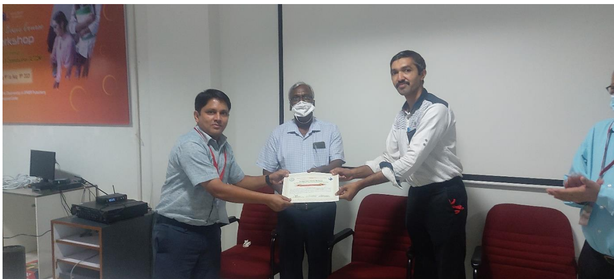
Participants receiving completion certificates