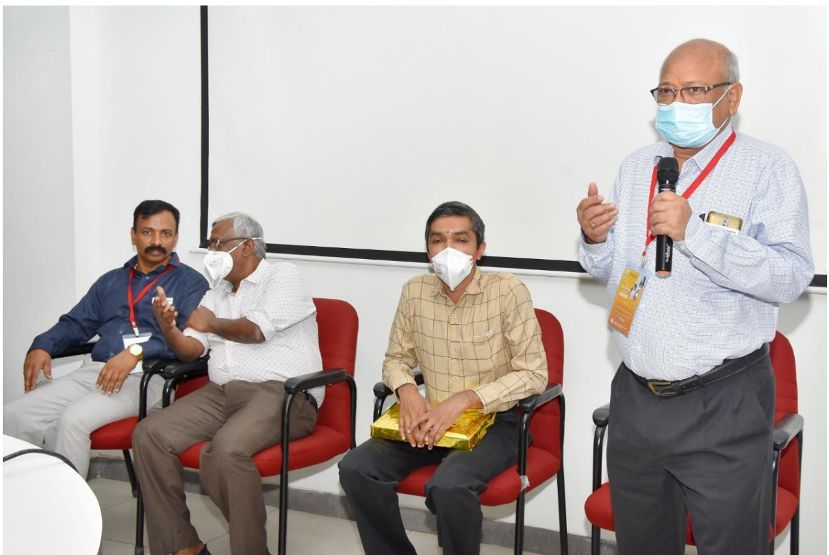
Inauguration - Program