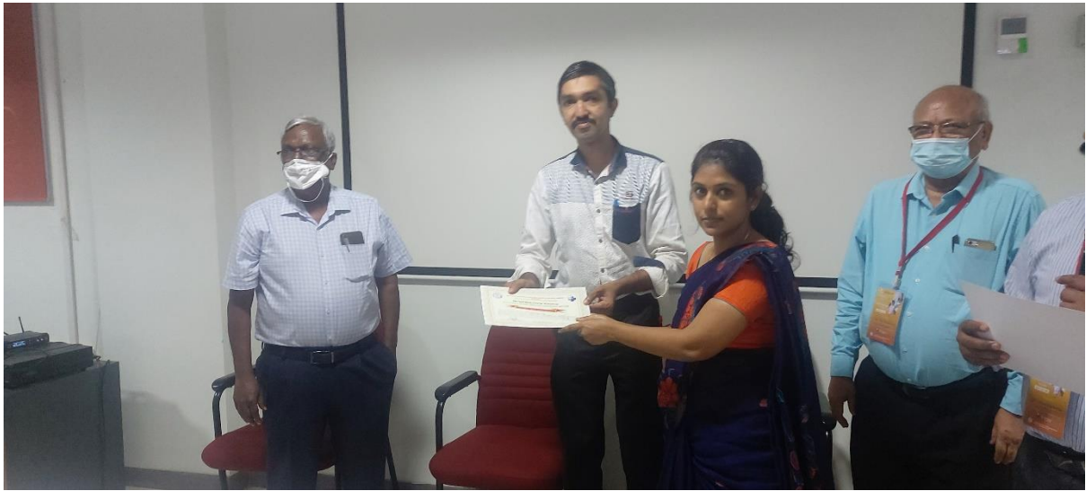
Participants receiving completion certificates