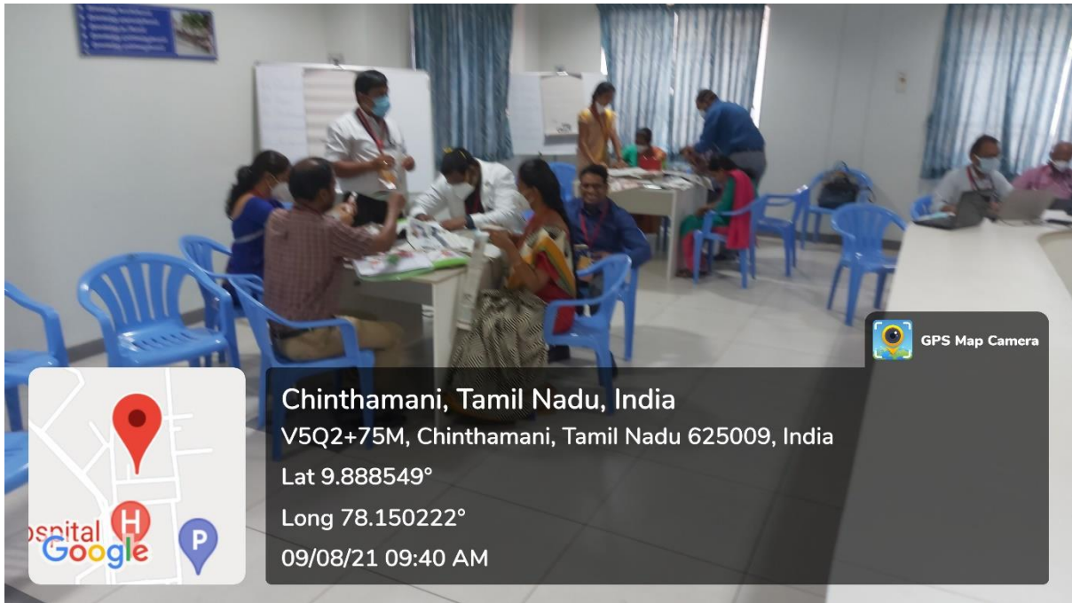
Workshop in progress